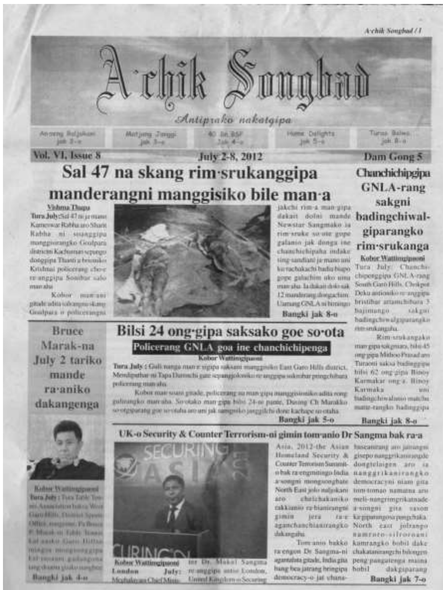
‘Achik Songbad’, The First Garo Secular Newspaper of Meghalaya