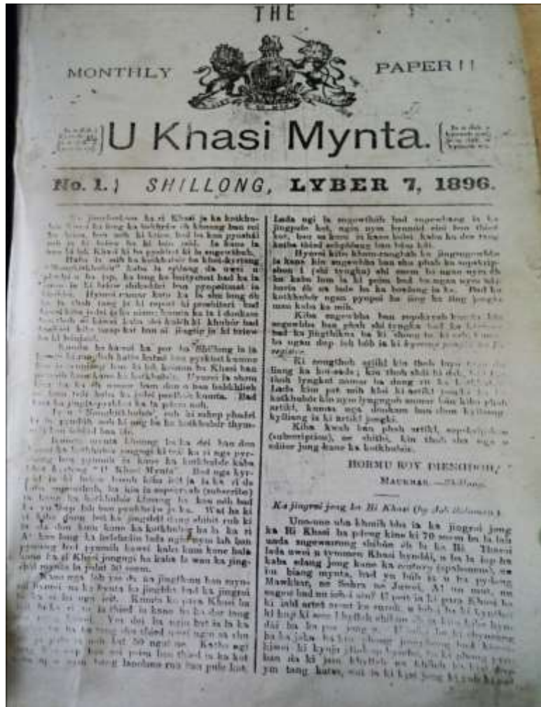
'U Khasi Mynta' - The First Khasi Secular Newspaper of Meghalaya