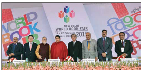
NEW DELHI WORLD BOOK FAIR, 2015

The Trust in collaboration with India Trade Promotion Organisation organised the annual New Delhi World Book Fair from 14 to 22 February 2015 at Pragati Maidan, New Delhi. Smt. Smriti Zubin Irani, Hon'ble Minister for HRD, Government of India inaugurated the Fair.