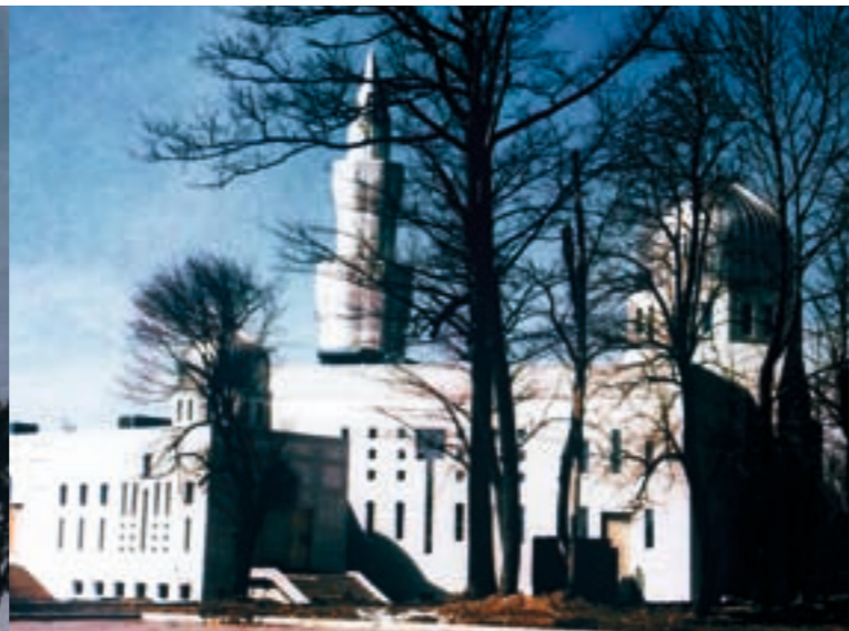
Bait Al-Islam Mosque, Maple, Ontario, Canada. Built in 1992 by Gulzar Haider.

The religious center combines a main prayer hall capped by a stainless steel dome. The architect successfully captures the spirit of medieval Mamluk architecture of Egypt in the new setting of Canada.