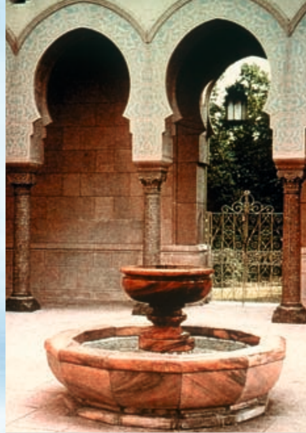
Islamic Center of Washington, Washington, DC. Built in 1950 by Mario Rossi.

The first large traditional Islamic style structure in the United States was inspired by the Mamluk architecture of Cairo. The design also includes Ottoman Turkish and Andalusian decorative motifs. The interior furnishings are also a multi-ethnic mix. The wall tiles were donated by Turkey, the chandeliers are from Egypt, and the carpets were a gift from the Shah of Iran. Financed by the diplomatic missions of Islamic countries and wealthy Muslim sponsors, the project became a symbol of Muslim unity and identity in the United States. The building is listed in the Historic American Buildings Survey.