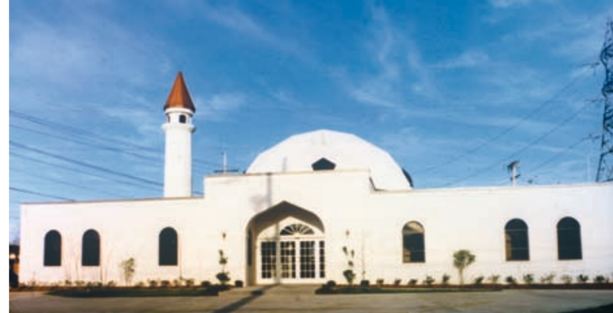
Mosque Abu Bakr Al Siddiq, Metairie, Louisiana. Built 1988 by Al-Dahab

The first large traditional Islamic style structure in the United States was inspired by the Mamluk architecture of Cairo. The design also includes Ottoman Turkish and Andalusian decorative motifs. The interior furnishings are also a multi-ethnic mix. The wall tiles were donated by Turkey, the chandeliers are from Egypt, and the carpets were a gift from the Shah of Iran. Financed by the diplomatic missions of Islamic countries and wealthy Muslim sponsors, the project became a symbol of Muslim unity and identity in the United States. The building is listed in the Historic American Buildings Survey.