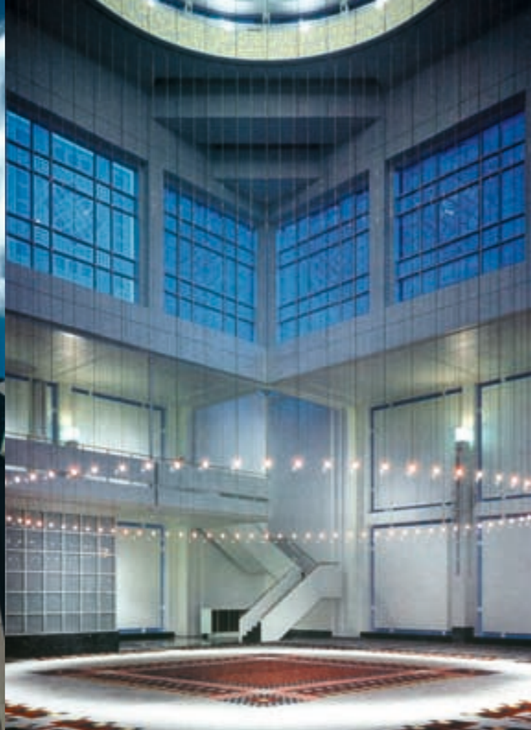
Islamic Cultural Center, New York, New York. Completed in 1991 by Skidmore, Owings & Merrill.

Traditional Ottoman forms, as well as Islamic geometrical icons and calligraphy are expressed effectively in contemporary architectural language.