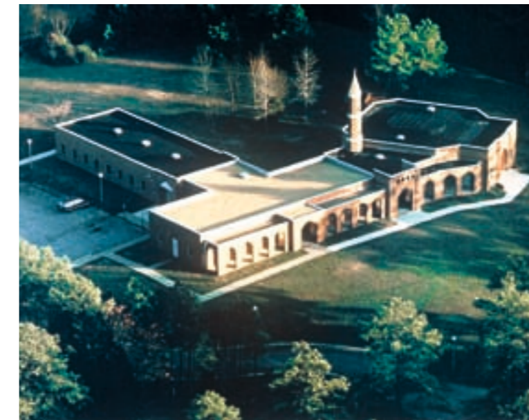
Islamic Center of Virginia, Richmond, Virginia. Built 1990 by Frahar-Favoro.

The religious center combines a main prayer hall capped by a stainless steel dome. The architect successfully captures the spirit of medieval Mamluk architecture of Egypt in the new setting of Canada.