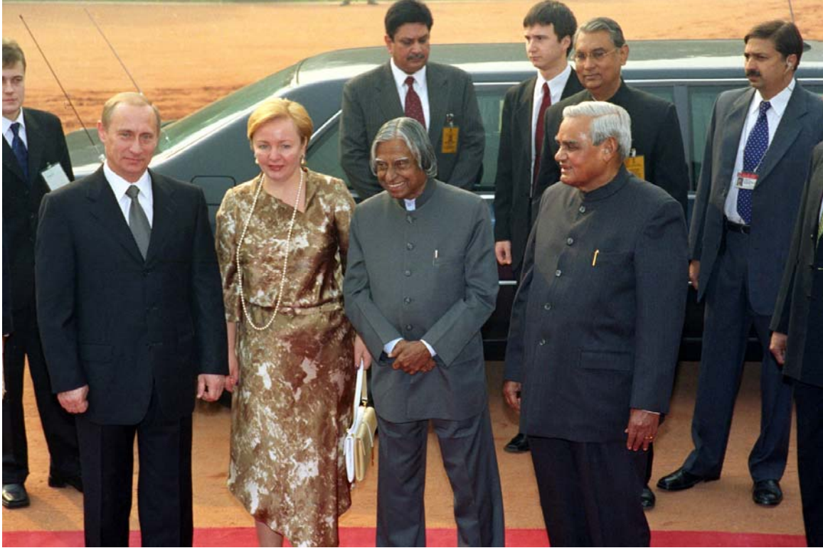
The President of Russia visit India : Ceremonial Reception at Rashtrapati Bhavan, The President Dr. A.P.J. Abdul Kalam & Prime Minister Sh. Atal Bihari Vajpayee seen in this picture