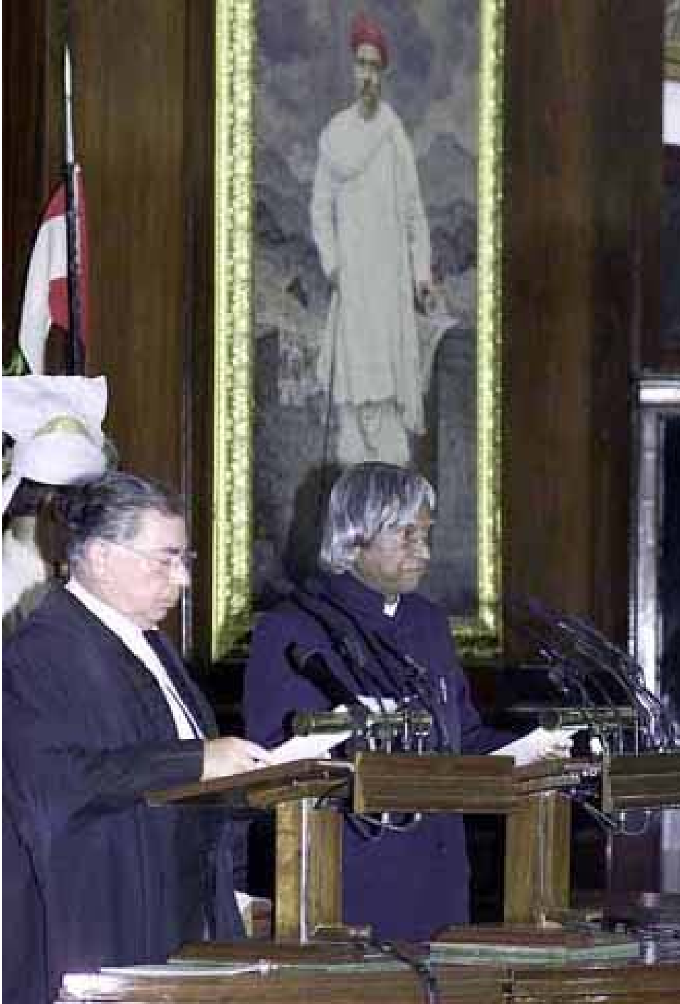
The Chief Justice of India Shri Kirpal administering the oath of the office of the President of India to Dr. A.P.J. Abdul Kalam at a Swearing-in ceremony in Central Hall of Parliament in New Delhi on July 25, 2002.