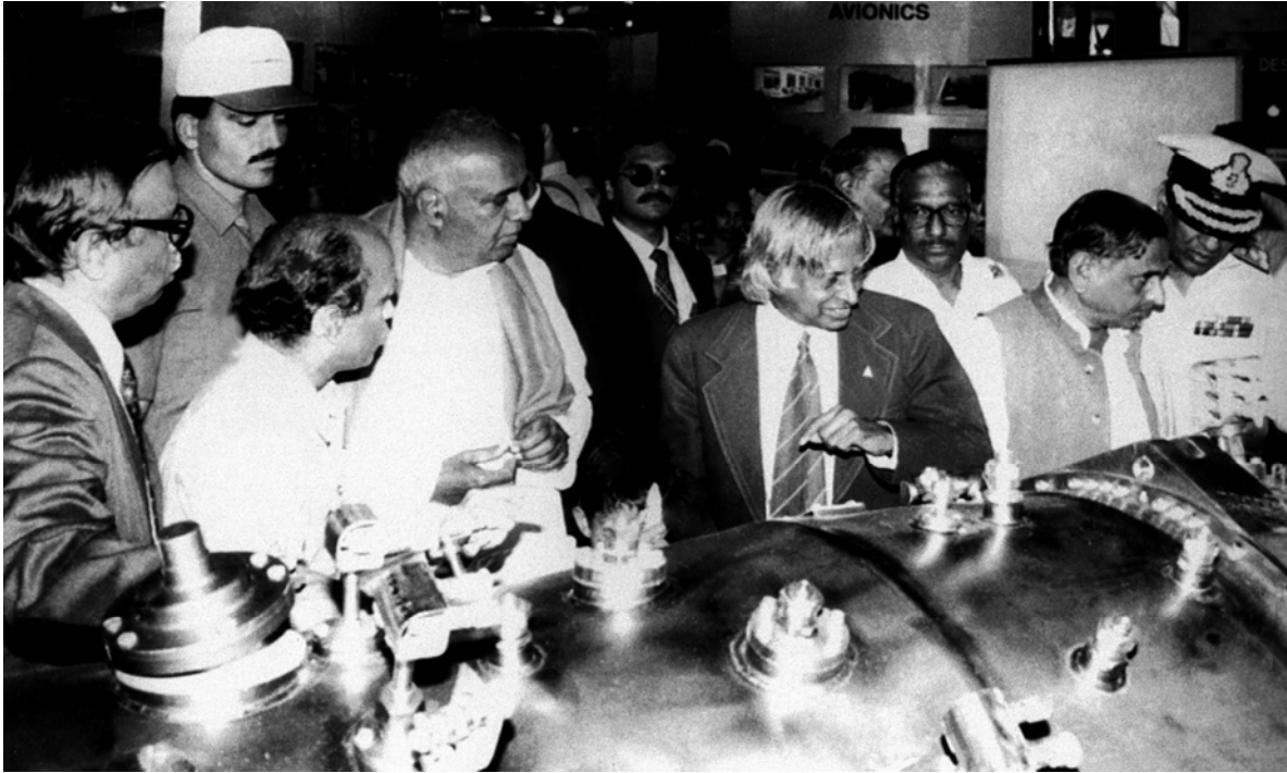
The Prime Minister, Shri H.D. Devegowda inaugurated the Aero India 1996, an International aerospace exposition, at the Indian Air Force Station, in Bangalore on December 3, 1996. Photo shows The Prime Minister Shri Gowda going round an Exhibition on the occasion. Also seen Shri Mulayam Singh Yadav, the Union Minister for Defence and Dr. A.P.J. Abdul Kalam, Scientific Advisor to the Defence Minister.