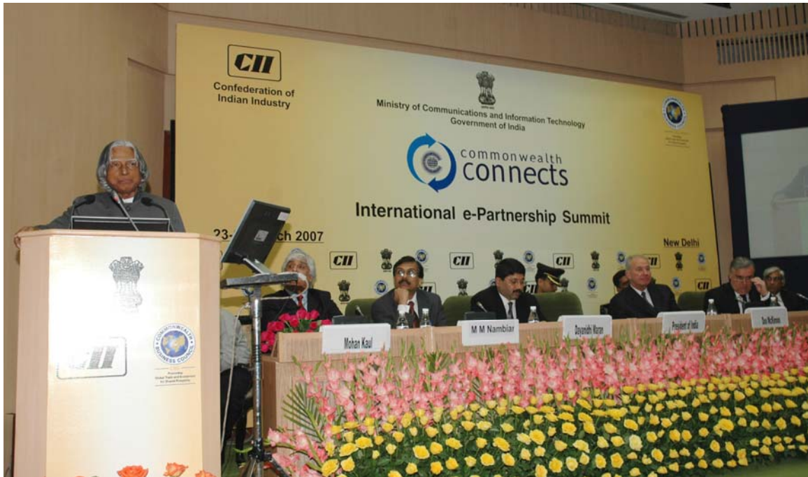
The President, Dr. A.P.J. Abdul Kalam delivering his inaugural address at ‘The Commonwealth Connects: International e-Partnership Summit’, organised by the Department of Information Technology in association with Commonwealth Business Council and Confederation of Indian Industries, in New Delhi on March 23, 2007.