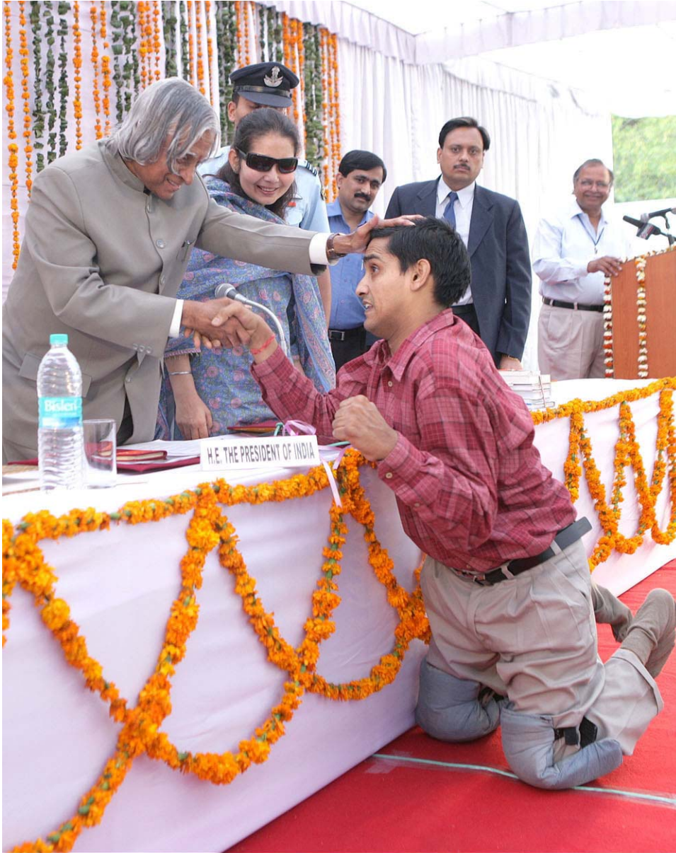
The President, Dr. A.P.J. Abdul Kalam blessing a mentally challenged student in a function organised by PRAYAS, in Jaipur on March 30, 2007.