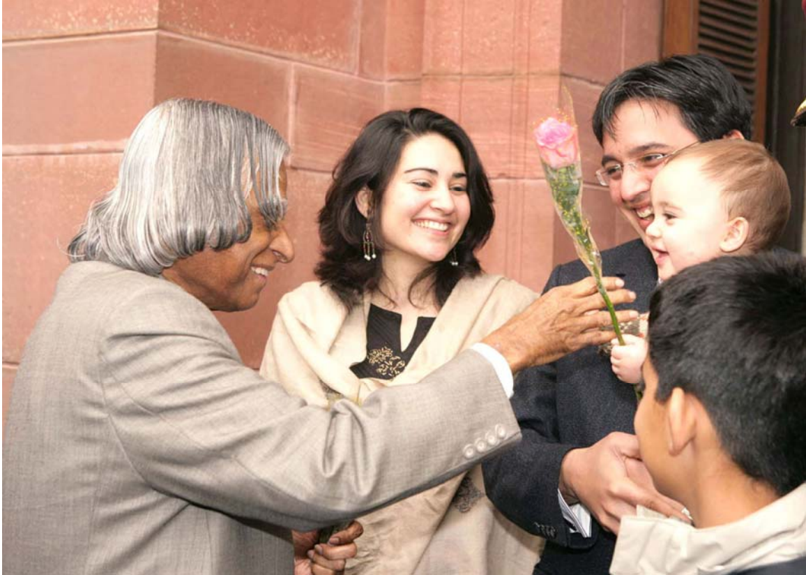
People from different walks of life greeting the President, Dr. A.P.J. Abdul Kalam on the occasion of New Year, in New Delhi on January 1, 2007.