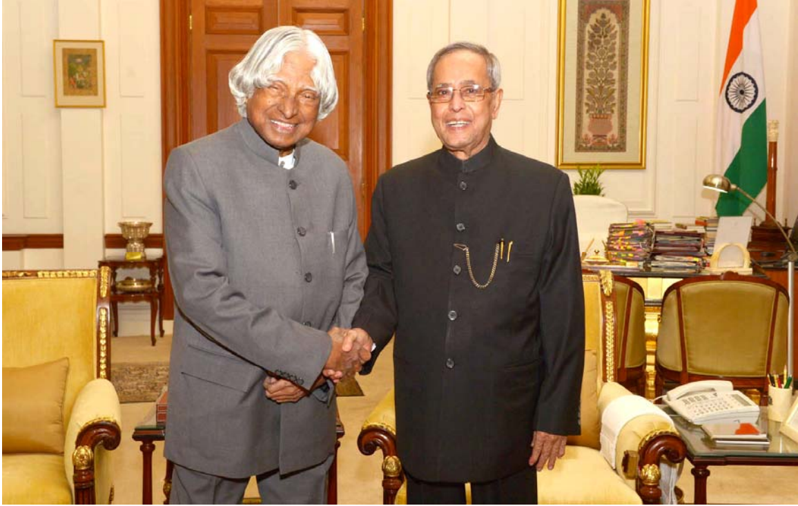
The former President, Dr. A.P.J. Abdul Kalam calling on the President, Shri Pranab Mukherjee, in New Delhi on December 24, 2014.