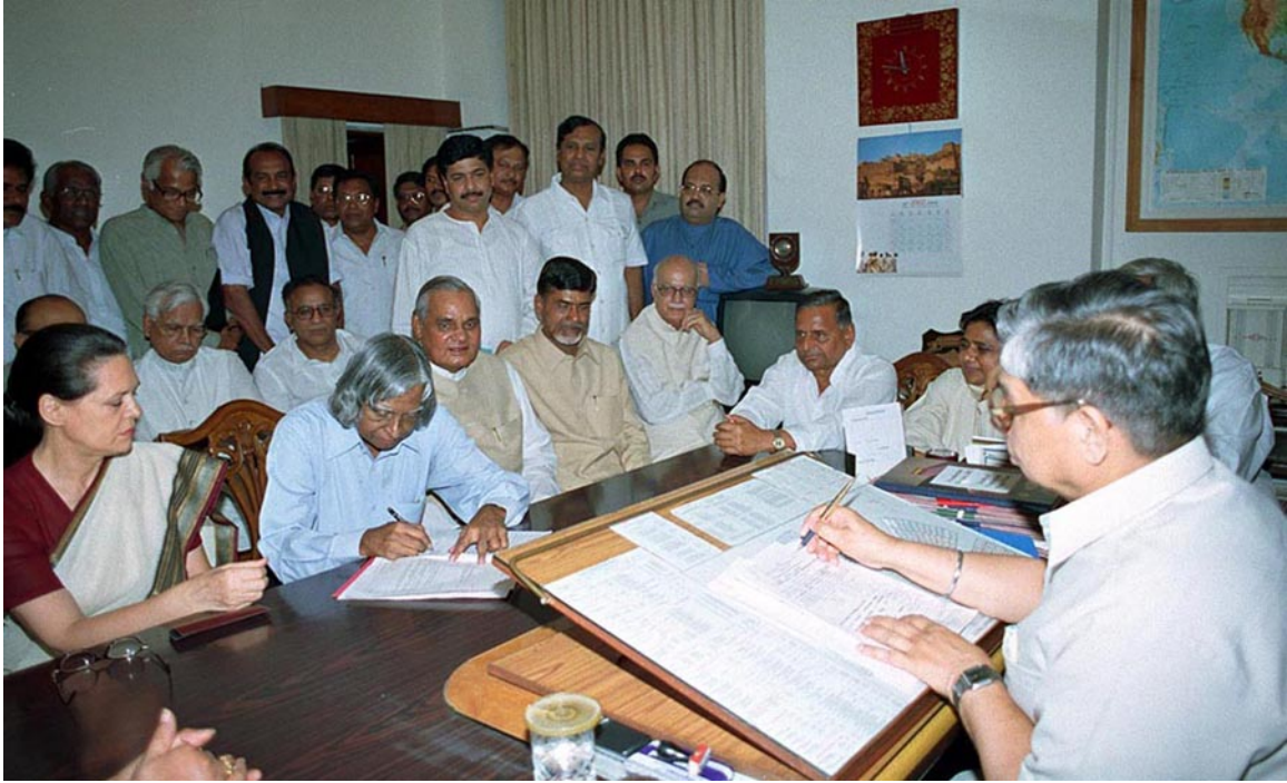
The Presidential candidate Dr. A.P.J Abdul Kalam filing his nomination papers for the Presidential election in presence of the Prime Minister Shri Atal Bihari Vajpayee and the Leader of the opposition Smt. Sonia Gandhi along with other political leaders', in New Delhi on June 18, 2002.