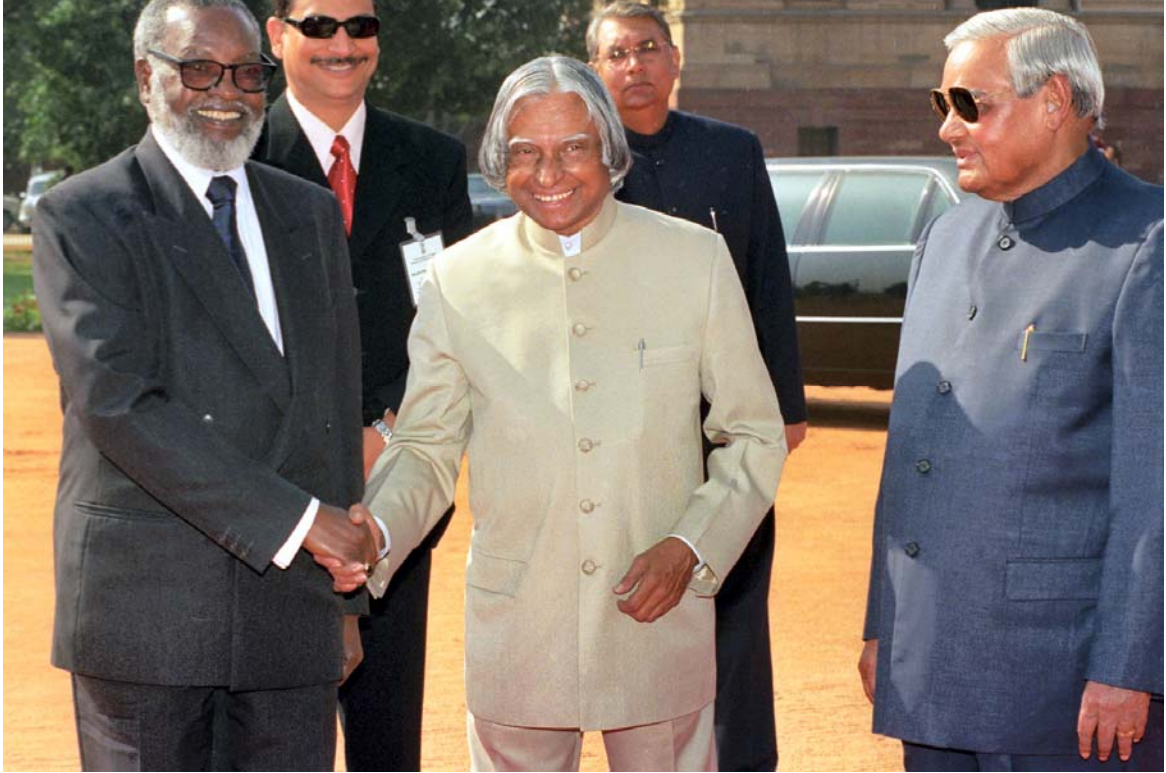
The President of Namibia visit India: Ceremonial Reception at Rashtrapati Bhavan, The President Dr. A.P.J. Abdul Kalam , Prime Minister Sh. Atal Bihari Vajpayee & Rajiv Pratap Rudy also seen in this picture