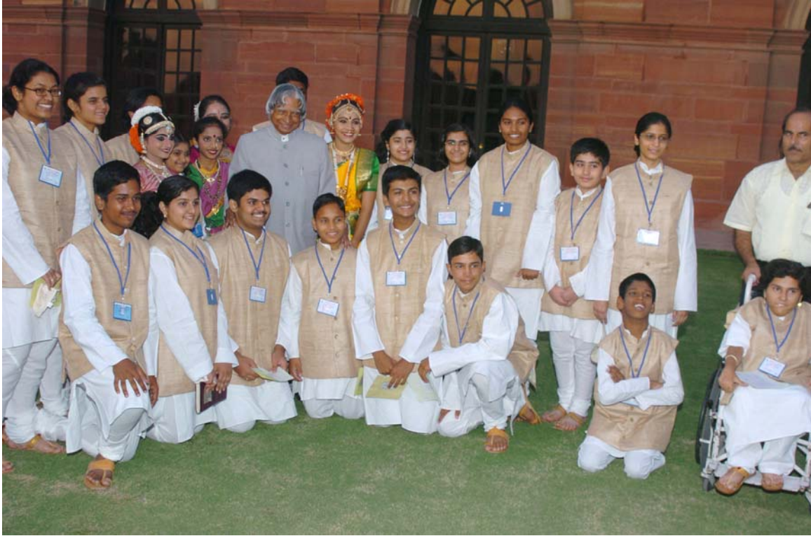
The President, Dr. A.P.J. Abdul Kalam with the awardees of Bal Shree Honour-2006, at Rashtrapati Bhavan, in New Delhi on June 01, 2007.