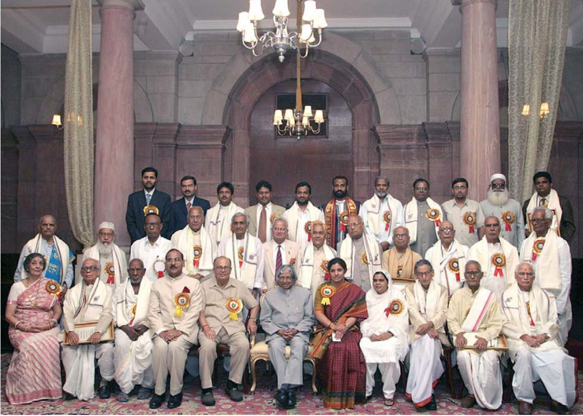
The President, Dr. A.P.J. Abdul Kalam and the Union Minister for Human Resource Development, Shri Arjun Singh in a group photo with Sanskrit, Pali Prakrit, Arabic and Persian scholars after presenting awards of certificate of honour, at a function held at Rashtrapati Bhavan, in New Delhi on May 21, 2007.