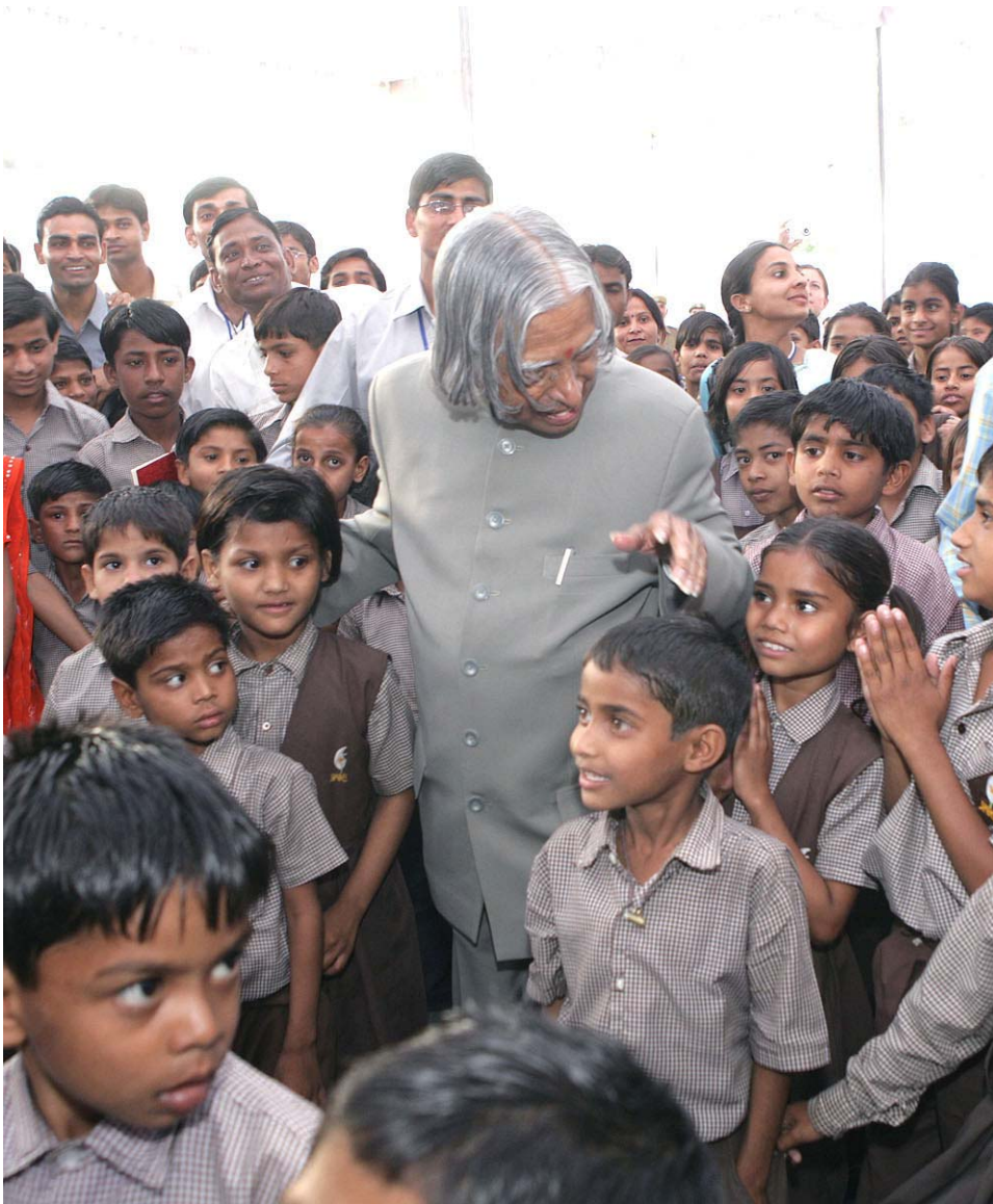
The President, Dr. A.P.J. Abdul Kalam with the physically and mentally challenged children in a function, at Jaipur on March 30, 2007.