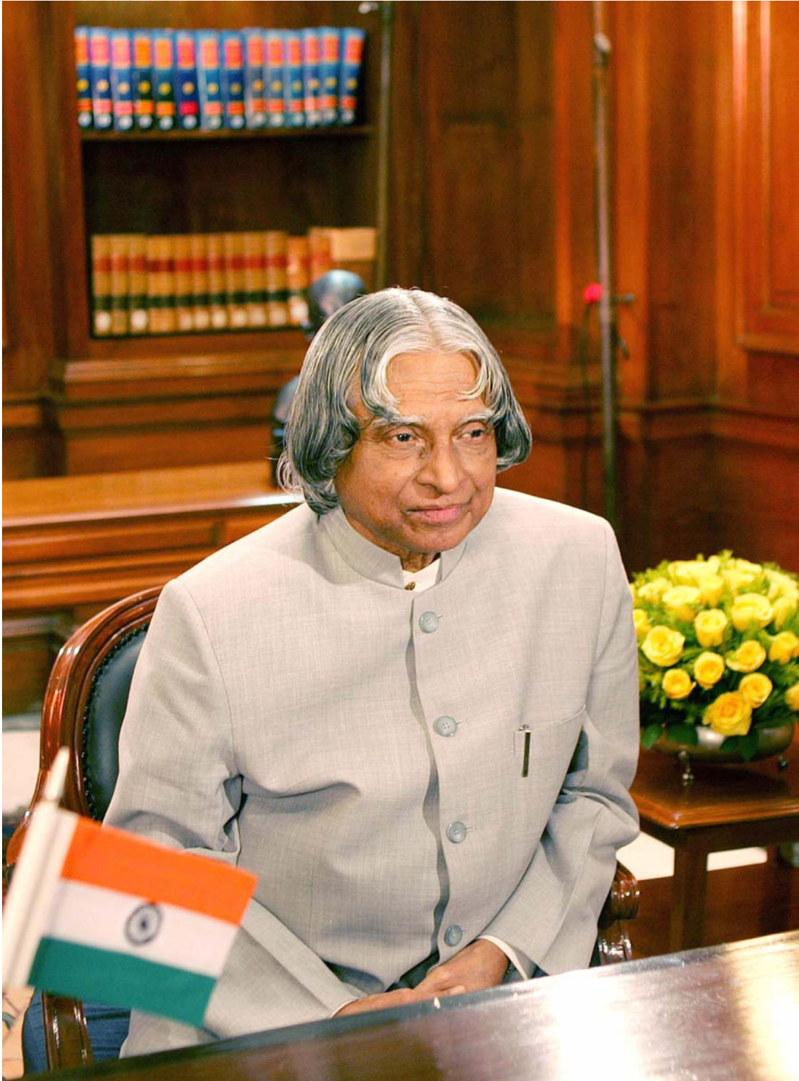
The President, Dr. A.P.J. Abdul Kalam addressing the Nation on the eve of Independence Day, in New Delhi on Aug 14, 2005.