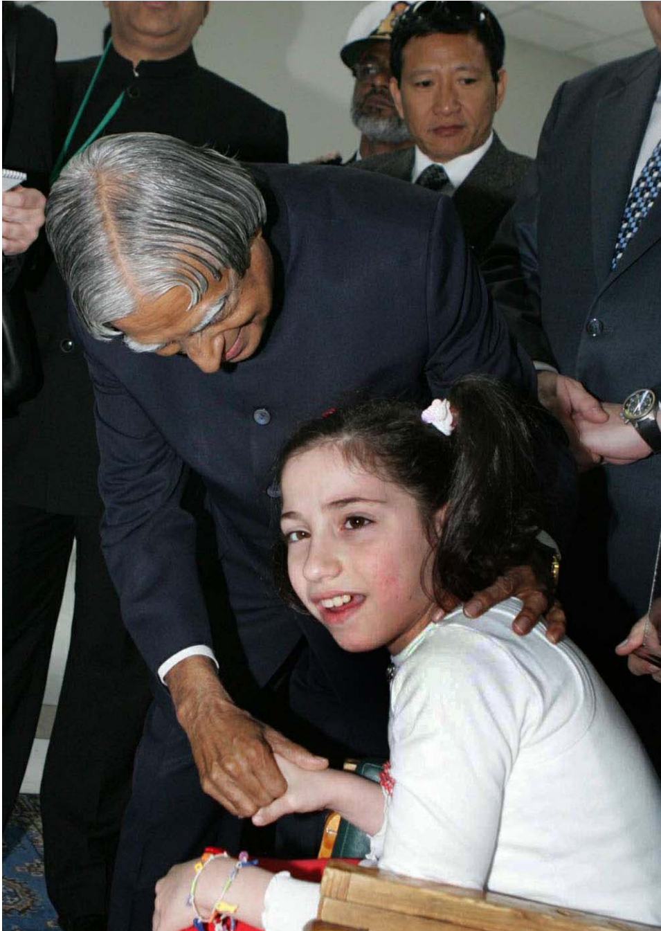
The President, Dr. A.P.J. Abdul Kalam visiting in the Rehabilitation Centre for Children with Cerebral Palsy in the outskirts of Athens and meeting the inmates on April 27, 2007.