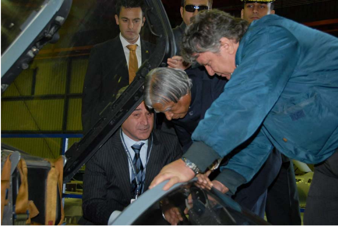
The President, Dr. A.P.J. Abdul Kalam entering the Cockpit of mirage 2000 -5 fighter aircraft while going around at Hellenic Aerospace Industries, in Athens on April 27, 2007