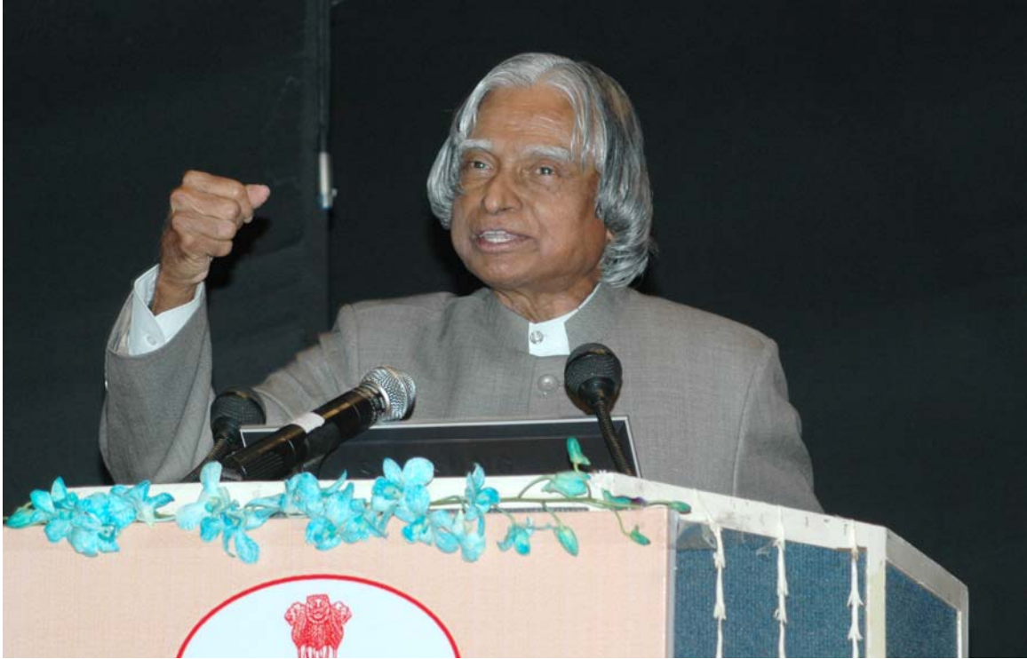
The President, Dr. A.P.J. Abdul Kalam addressing at the International Seminar on Emerging World Order: Implications for Security Calculus of Extended South Asian Region, in New Delhi on February 22, 2007.