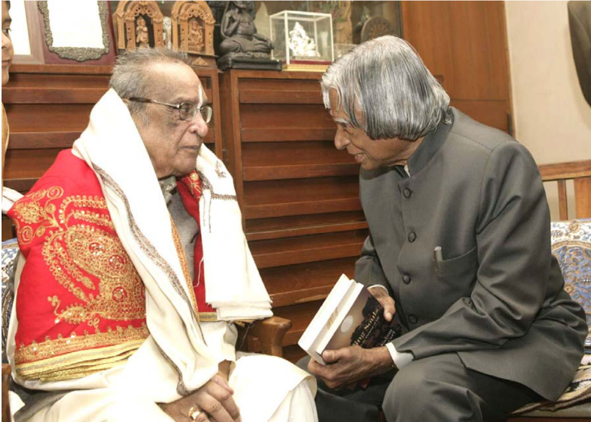
The President, Dr. A.P.J. Abdul Kalam meeting Pandit Bhimsen Joshi at his residence in Pune during the course of his visit to the city on January 17, 2007.