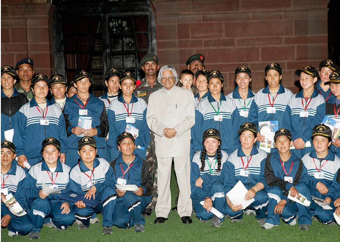
The President, Dr. A.P.J. Abdul Kalam with the students from Women Empowerment Centre and Adult Literacy Centre Ladakh (J&K), at Rashtrapati Bhavan, in New Delhi on September 19, 2006.