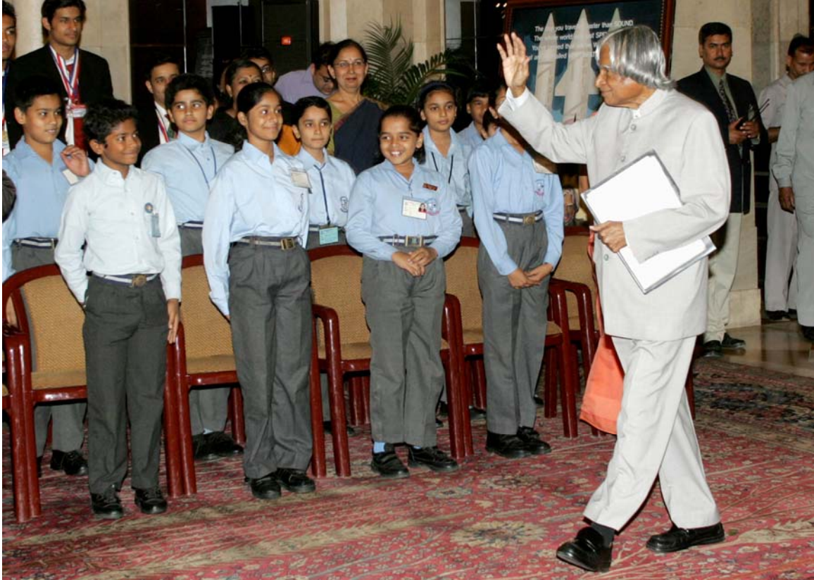
The President, Dr. A.P.J. Abdul Kalam interacted with school children from various parts of India on the occasion of children's day, at Ashok Hall of Rashtrapati Bhavan, in New Delhi on November 14, 2006.