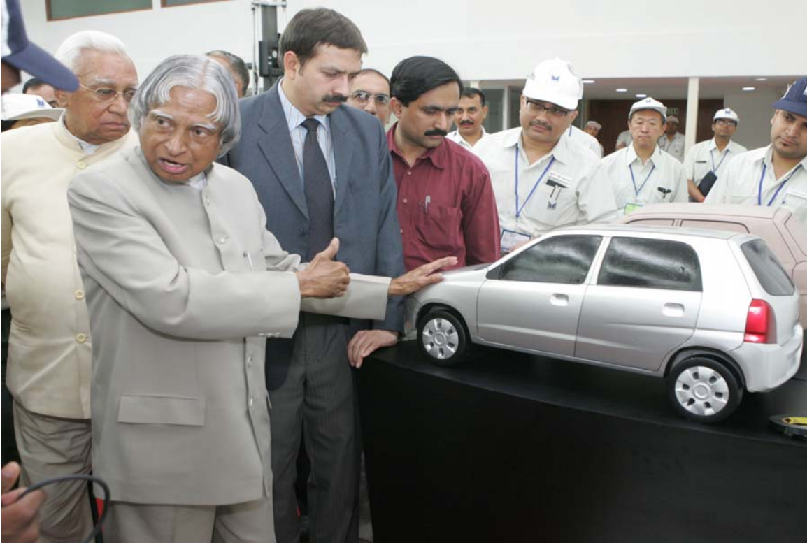
The President, Dr. A.P.J. Abdul Kalam visited the Maruti Udyog Limited in Gurgaon, Haryana on May 25, 2007.