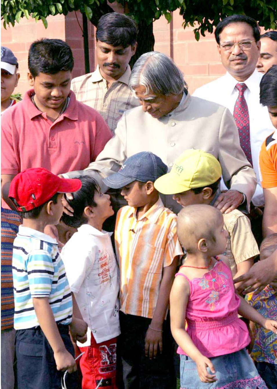
The President, Dr. A.P.J. Abdul Kalam with the group of children undergoing treatment for blood Cancer, at Rashtrapati Bhavan, in New Delhi on May 30, 2007.