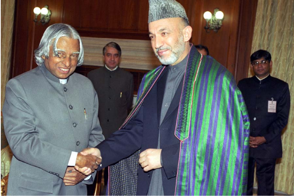
State visit of IMS excellency Mr. Hamid Karzai President of the Transitional Islamic State of Afghanistan from March 05 - 08, 2003: Call on the President, Dr. Abdul Kalam.