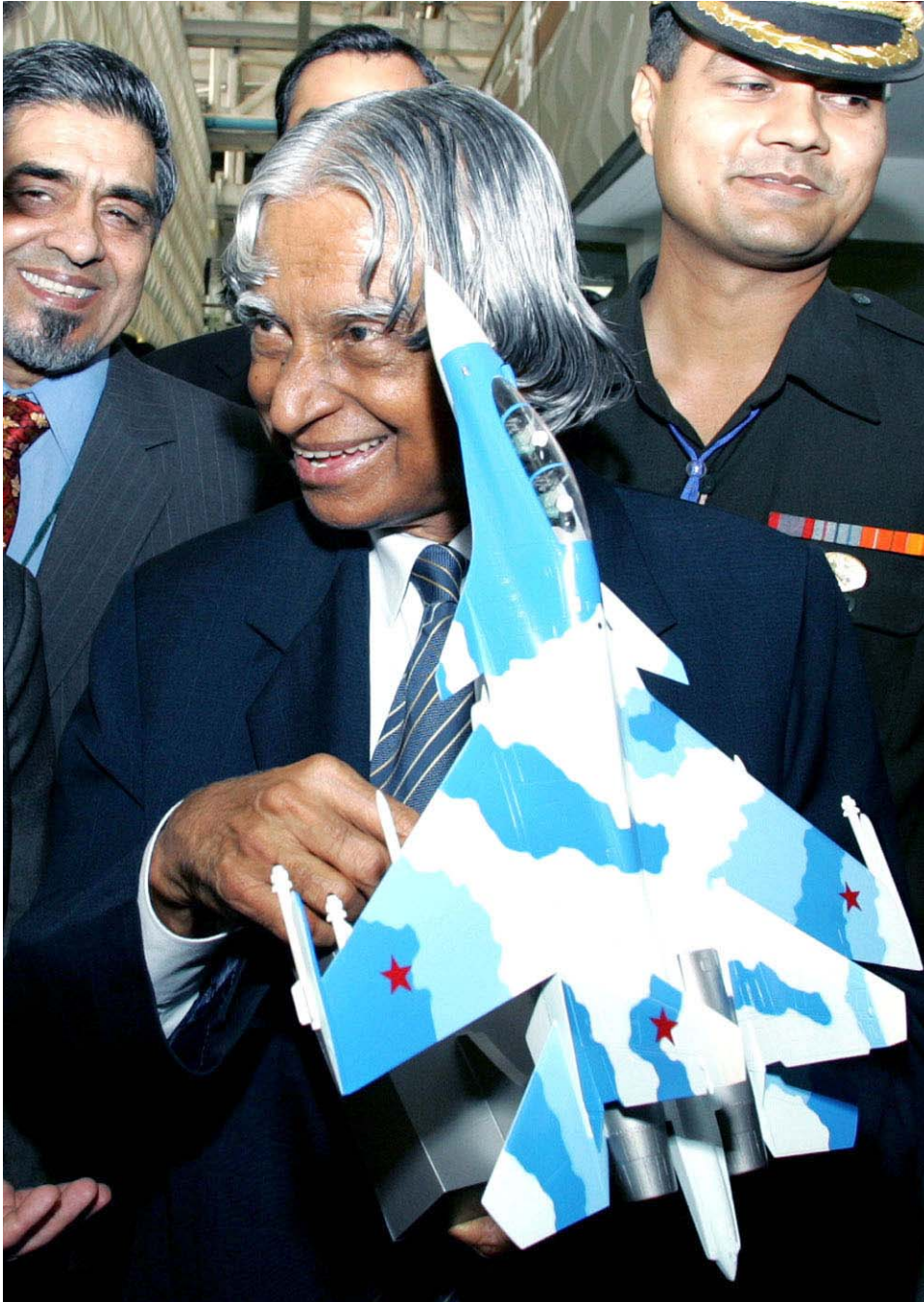
The President, Dr. A.P.J Abdul Kalam with a model of the latest Sukhoi Aircraft presented to him while on a visit to the Sukhoi Design Bureau, in Moscow on May 23, 2005.