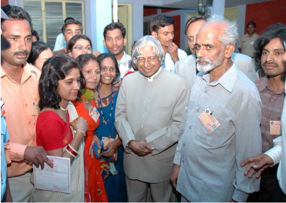
The President, Dr. A.P.J. Abdul Kalam interacting with the students of the Mahatma Gandhi Hindi Antarrashtriya Vishwavidyalay, at Wardha, Maharashtra on June 15, 2007.