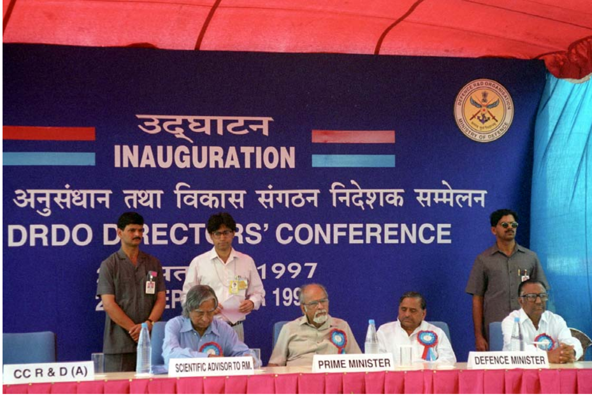
Inauguration Prize distribution 23rd DRDO Director Conference: the Prime Minister, Shri I.K. Gujral & Dr. Abdul Kalam also seen this picture