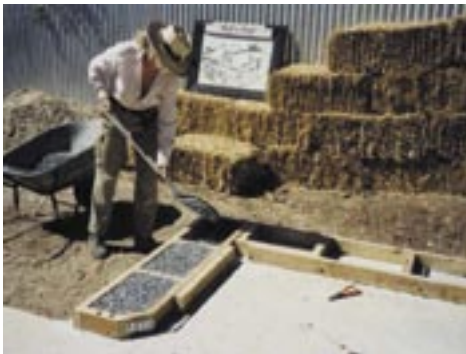
Ladder frame being filled with pea gravel prior to frame and bale placement.

The general availability of straw bales is good, with many settled parts of Australia being within an hour or so of wheat or rice straw supplies. Straw bale is a low cost material but requires labor-intensive construction techniques. Straw bale construction can be very low cost provided the labour input is also low cost. Projects that can guarantee some volunteer or workshop-based construction can guarantee cost savings. Straw bale cost savings can be used to offset other costs. In South Australia, a large, detached dwelling, with a high standard of fittings and finishes and built entirely via conventional building contractual arrangements, cost the same as if it were in double brick, but had a much better, cost saving thermal performance.