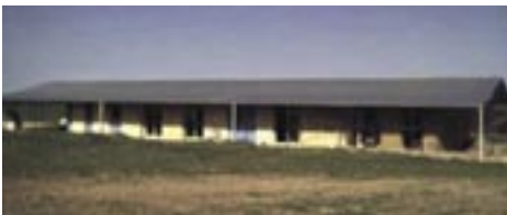
Low cost owner built straw bale in the country.

Straw bale structures are likely to attract interest. Sometimes that interest is not positive and it is wise to maintain vigilance during construction and to ensure that loose straw and sawdust or other combustibles are not left in or around the structure at any time. Some trades use fire, such as oxy cutters and welders. Special care should be taken to manage activities that are of high fire risk.