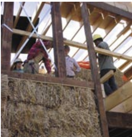
The middle plate and vertical compression wires can be seen in this detail of a timber framed 3 storey straw bale townhouse.

Slicing a bale requires that it is first 'sewn' at the desired finished length, then the original twine is cut. The idea is to produce two short bales with the same compression as the original, held by new sets of twine. The cutting and trimming of bales can be done with hand tools, but the most popular and effective method is to use a chain saw with a blade length of at least 400mm.