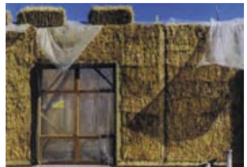
Window set towards outside face of wall.

Windows, doors and other openings in straw bale walls generally have to be placed within a frame designed to withstand compression loads, unless the window or door frames are themselves strong enough to do the job. These frames are sometimes called 'bucks'. With bucks to resist distortion, almost any kind of window or door can be set into a straw wall, 'floating' in the bales or tied to frames. Until the walls have undergone final compression, bucks, window and door frames must have adequate temporary cross-bracing.