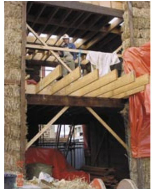
Framed construction provides more design freedom for wall and opening placement – in this example a large 2 storey bay structure with a partly cantilevered floor construction has been easily achieved but would not be possible in the same way in a load bearing straw bale structure.