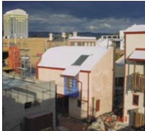
Straw bales in the city. There is no location that straw bale building cannot adapt to.

Finished straw bale walls are invariably rendered with cement or earth so that the straw is not visible. The final appearance of rendered straw bale can be very smooth and almost indistinguishable from rendered blockwork, or it can be more expressive and textural. There is a project in London, England, for instance, that made straw bales visible in the completed construction by placing them behind corrugated acrylic cladding.