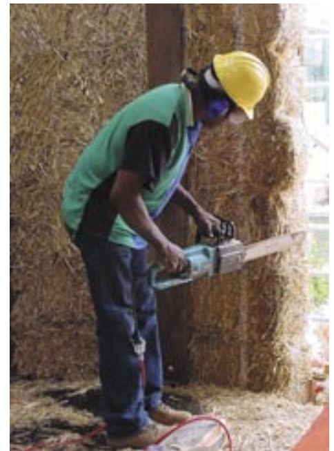
Bales are trimmed for openings and can be cut to fit structural members.

It is possible to fix substantial loads to load bearing and non-load bearing straw bale walls by forming clamps made from planks of timber on either side of the bales, tied through the wall with high tensile wire and tensioned by gripping or twisting. Other methods for fixing such things as shelves and kitchen cupboards simply use elements connected to the load bearing frame. With cement rendered interior skins that are a nominal minimum of 30mm thick, it is possible to hang pictures and other items off plugged holes in the thin masonry skin.