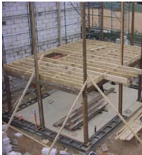
Framework and posts can be constructed off-site and the frame can allow a roof to be constructed in advance of the wall raising, providing shelter during the wall construction process.

Although it is possible to build strong and effective single storey straw bale structures, it is often easier to ensure Code compliance and predictable engineering outcomes if the straw bale walls are constructed as in-fill elements between load bearing frames. Non-load bearing straw bale walls are very similar to load bearing but are generally more complex and have to be connected to the frames within which they sit. The frames allow more freedom in the design and placement of openings and a running bond is not as essential as it is with load bearing walls. Pre-compression is still necessary to avoid future problems with settling of the bales over time.